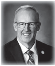
GREG SANKEY Commissioner